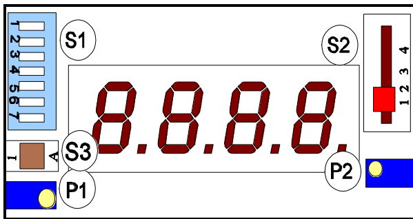
FIG.1 Location of Switches (Front Panel)